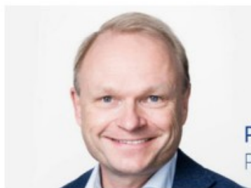
Pekka Lundmark President and CEO

In Q2 we delivered stable net sales in constant currency compared to the prior year. As a result of prudent management of our costs, we were able to deliver a solid comparable operating margin of 11.0% despite the regional mix headwinds faced in our Mobile Networks business. Considering the significant decline in major North American operators' investments, our operating margin has proved resilient, even adjusting for the EUR 80 million of catch-up net sales in Nokia Technologies.