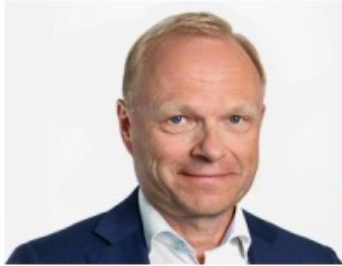
Pekka Lundmark President and CEO

As expected, the ongoing market weakness drove a 19% year-on-year constant currency decline in net sales in the first quarter. However, we have seen continued improvement in order intake, meaning we remain confident in a stronger second half and achieving our full year outlook. Driven by the patent licensing deals signed in Nokia Technologies, we achieved a comparable operating margin of 12.8% in Q1, compared to 8.2% the year before. We also generated almost EUR 1 billion in free cash flow in the quarter, which is a very strong performance.